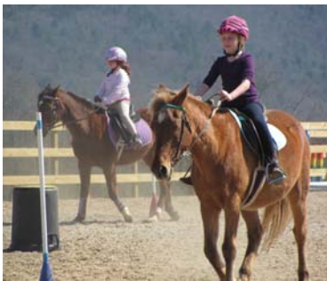
It's the winning Racing Stripes team against the Punk Rock Ponies in our March 16 Intro Games Camp!