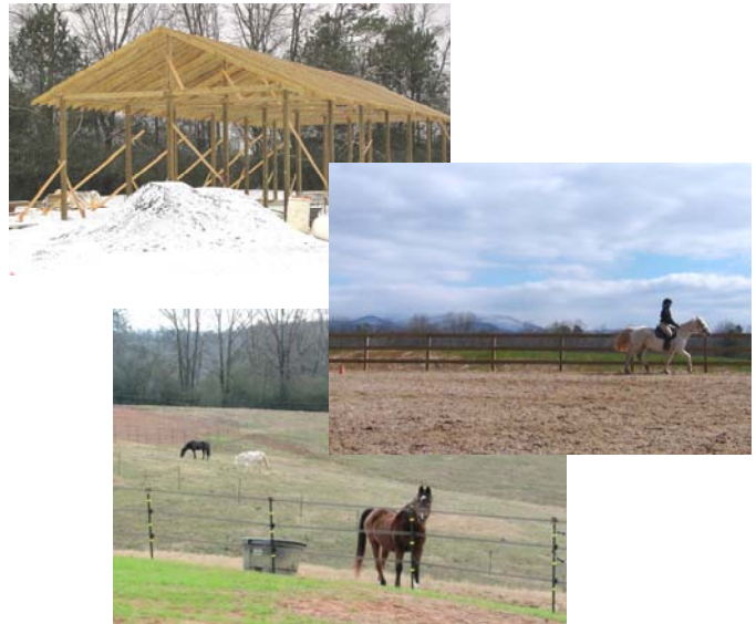
We love our new home at Hy-View Stables!

Hitman is a 13.2hh grade pony, a lesson veteran capable of jumping 2'-2'6" with ease. He can be strong, so not suitable for a timid rider. Hitman is VERY fat and needs a dedicated young rider to help keep him in shape! Hitman is available for lease on Mondays .